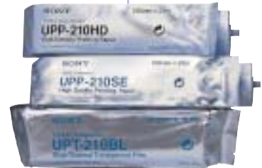
UPP-210HD, UPP-210SE and UPT-210BL Media