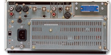
SVO-9500MD Back Panel